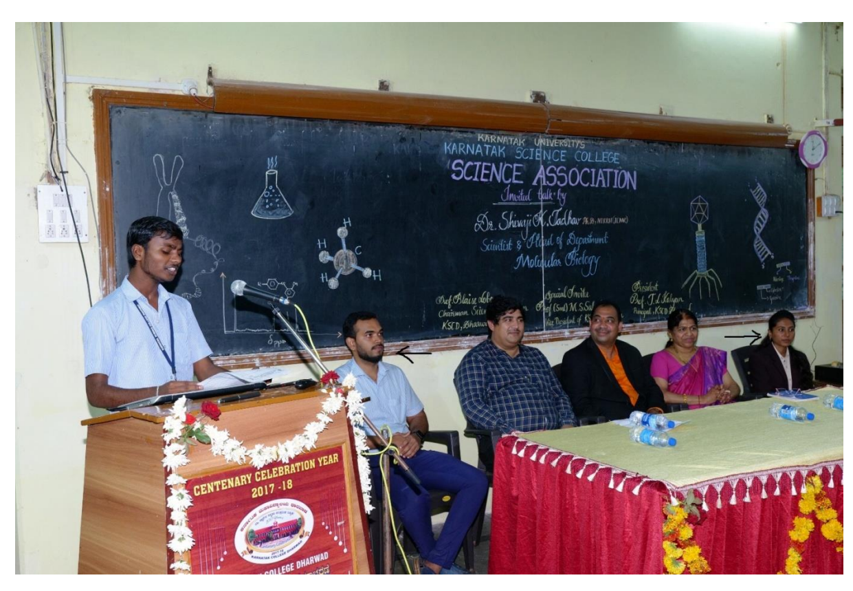
Science Association Student Representative